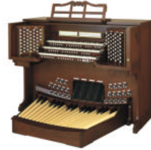
DB390 80 Stop / Three-Manual Console