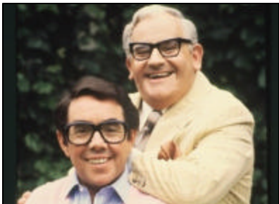
And now more news from the Two Ronnies

... The man who invented the zip fastener was today honoured with a lifetime peerage. He will now be known as the Lord of the Flies.